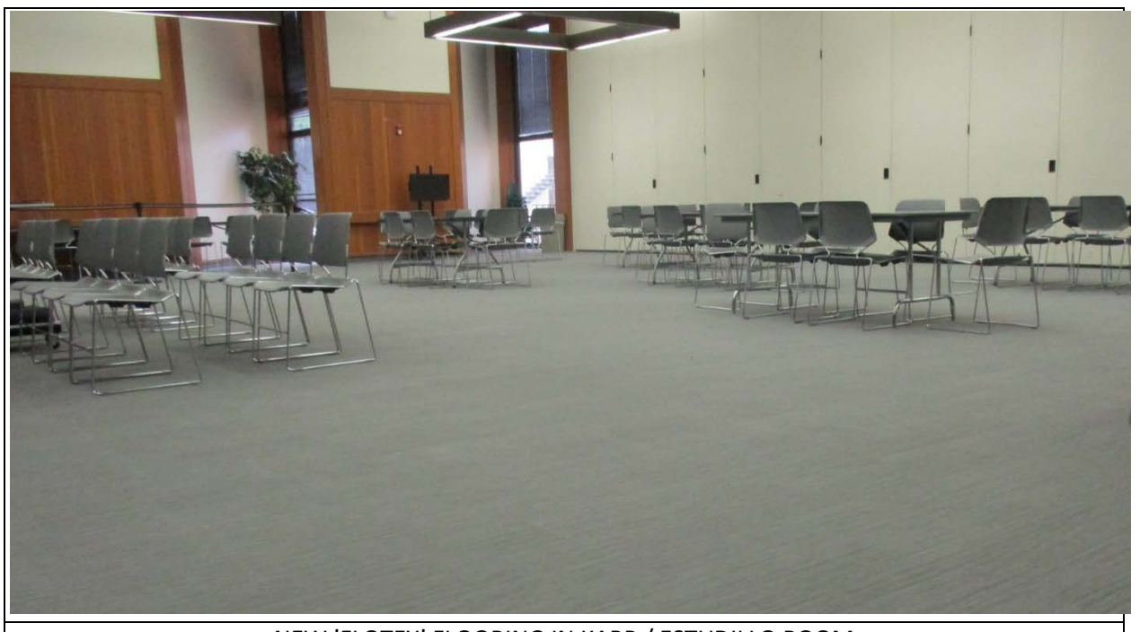
NEW 'FLOTEX' FLOORING IN KARP / ESTUDILLO ROOM